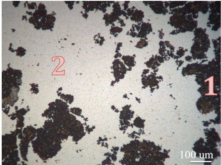
Figure 2: 200x Optical Microscope Image of Substrate