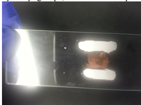
Figure 2: SERS substrate on a glass slide, with a SAM of decanethiol and mercaptohexanol.

Figure 1: Raman spectra of solid isomeric sugars, showing that Raman can be used to separate isomeric carbohydrates, as these sugars only differ in the axial/equatorial conformation of hydroxyl groups, but the Raman spectra are each unique.