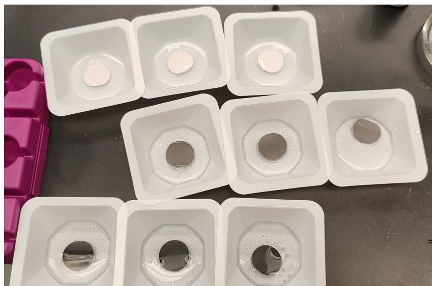
Figure 1. Nylon membranes after being soaked in various concentrations of \text{Pd}^{2+} and reduced

After synthesizing the membranes, the Pd could be attached by soaking the membranes in solutions of \text{PdCl}_4^{2-} or \text{PdNO}_3 ( \text{Pd}^{2+} ) for 24 hours and then reducing the Pd attached to the membranes using \text{NaBH}_4 . The amount of palladium attached to the membranes can be quantified by measuring the initial and final concentration of Pd in the solutions that the membranes were soaked in.